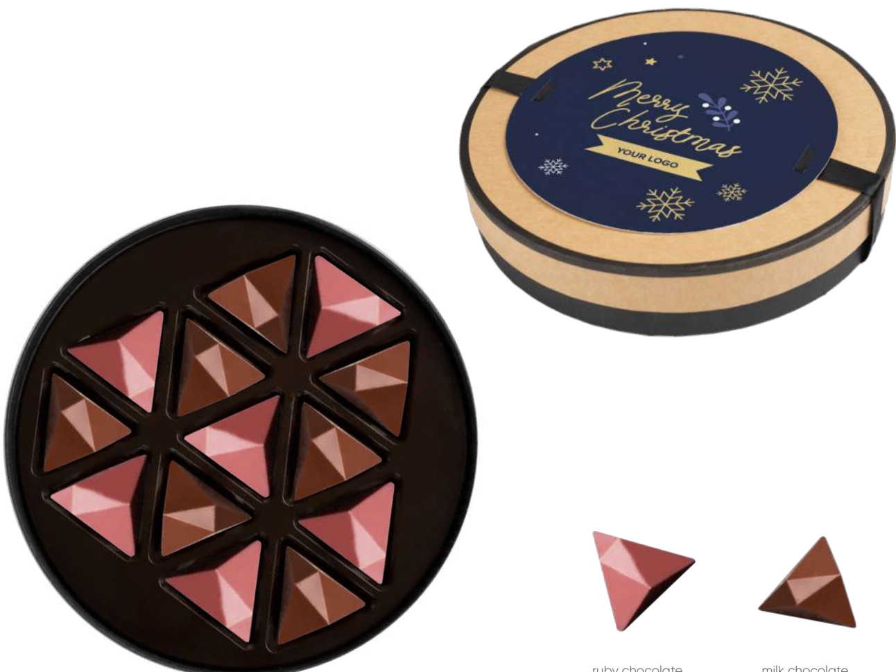
ruby chocolate with pistachio filling